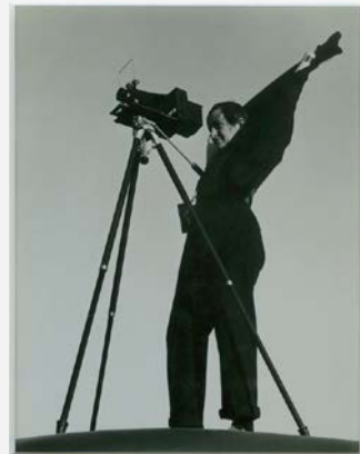
Dorothea Lange, 1937.