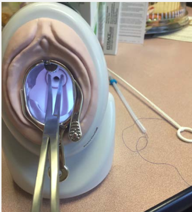
"I was even able to insert a fake IUD into a model uterus"