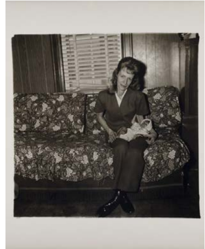
Diane Arbus, A woman with her baby monkey, N.J. 1971 , 1971, gelatin silver print